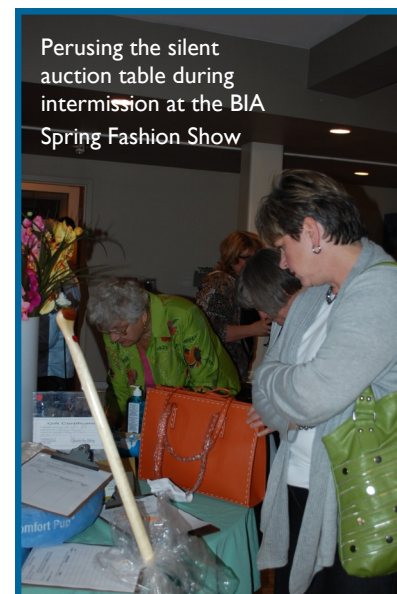
Perusing the silent auction table during intermission at the BIA Spring Fashion Show