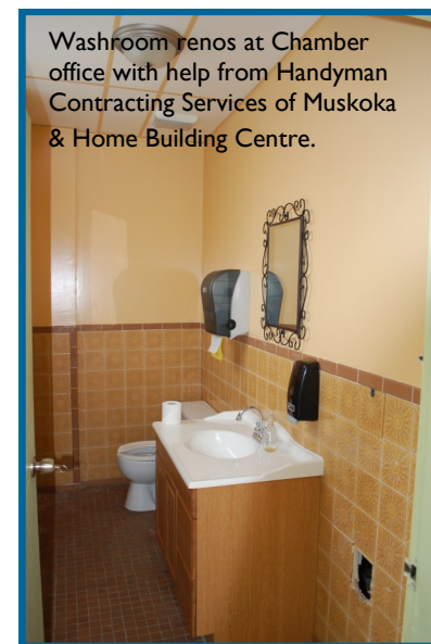
Washroom renos at Chamber office with help from Handyman Contracting Services of Muskoka & Home Building Centre.