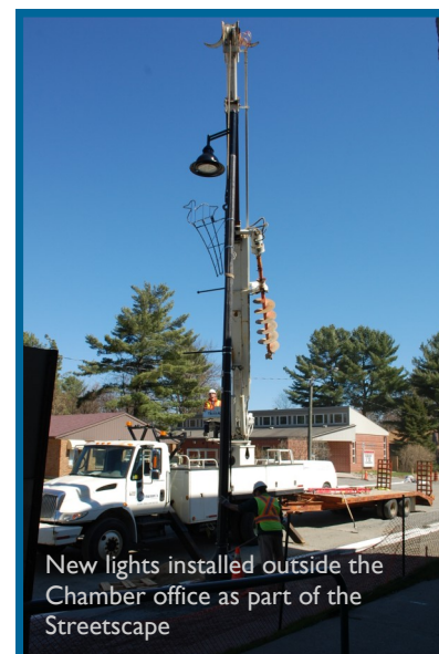
New lights installed outside the Chamber office as part of the Streetscape

elearnnetwork.ca is a publicly funded organization dedicated to increasing access to post secondary education in small and rural communities in eastern and south western Ontario. elearnnetwork.ca makes it possible for you to upgrade your basic skills, learn a new trade, or earn a college diploma or university degree with leaving your community.