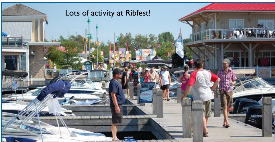
Lots of activity at Ribfest!