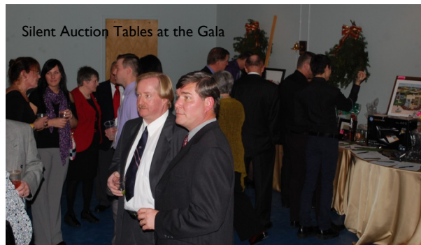
Silent Auction Tables at the Gala

Thursday Dec 16 from 6 PM - 10 PM. The shops in the block will be staying open that evening until 10 PM as well.