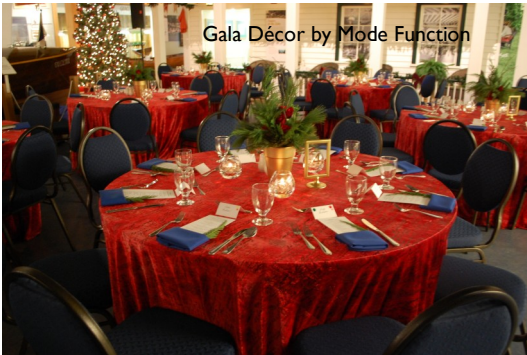
Gala Décor by Mode Function

W e were fortunate again this year to have good weather for the Santa Claus parade. Our parade